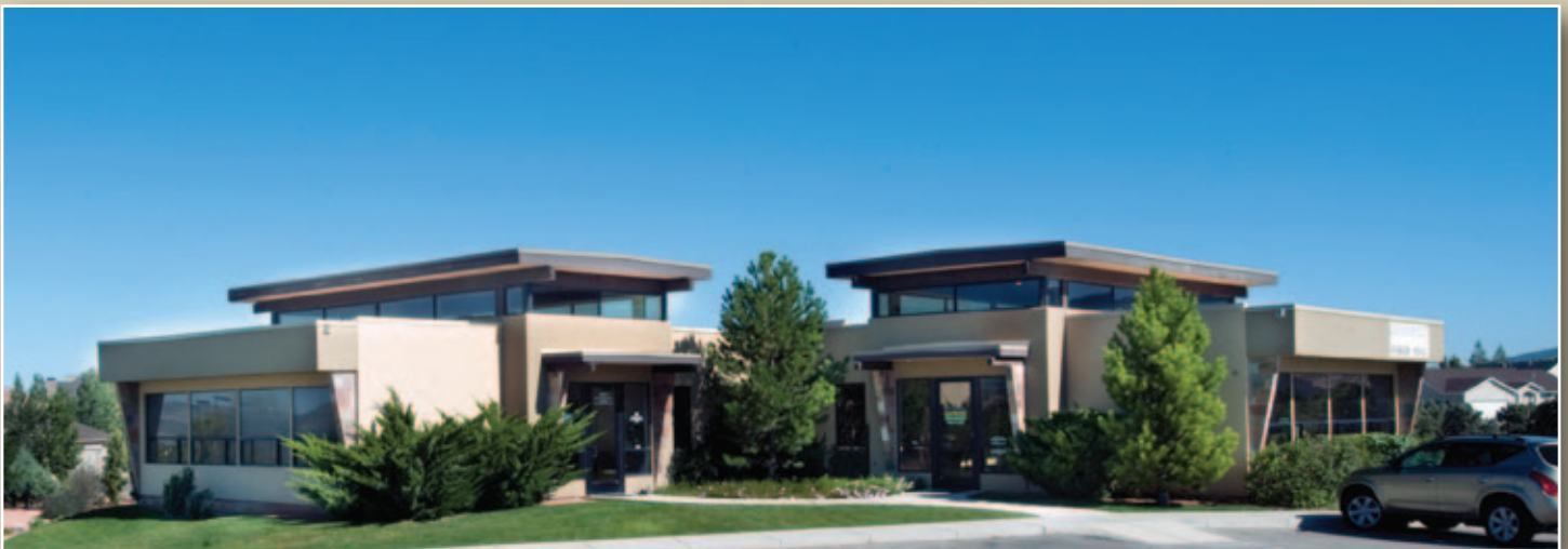
Mesa Hill's Offices & Neighborhood Commercial Site