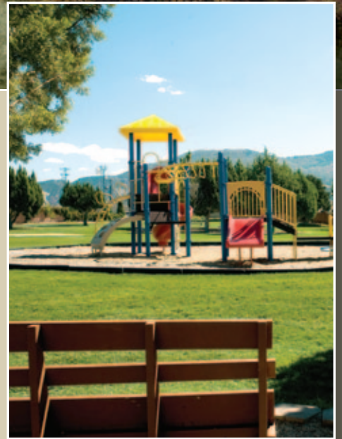
Parks & Trails

A Tradition of Building New Neighborhoods