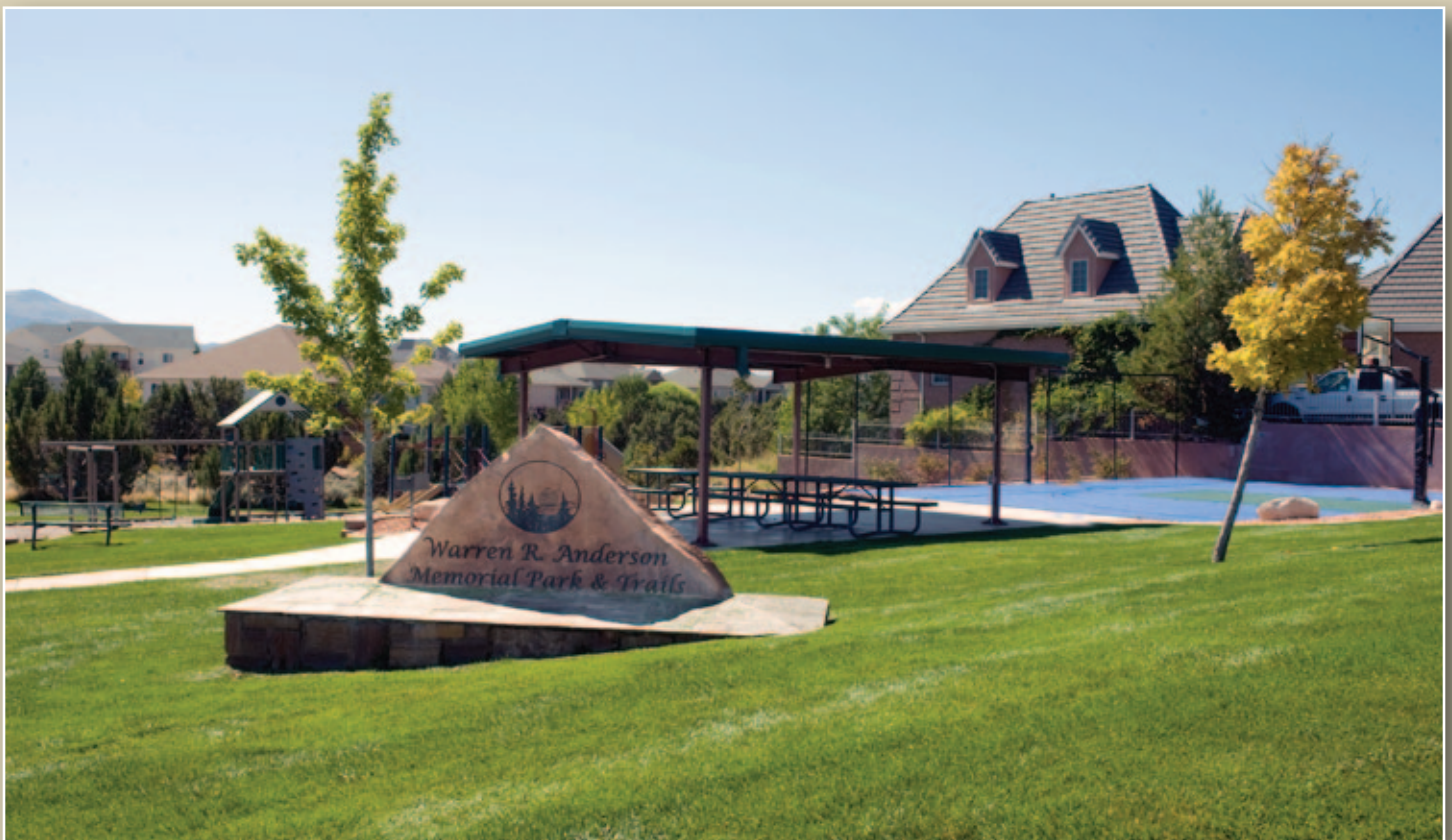
Private Park with Sport Court, Pavilion & Tot Lot