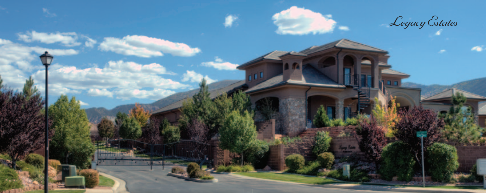
Custom Home Lots